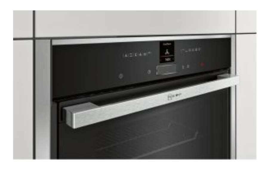
NEFF Graphite Grey Oven